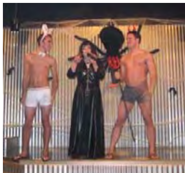
College Costume Night at Craze