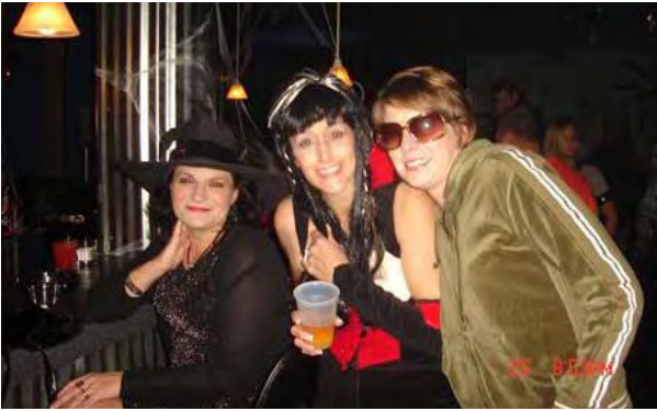
Halloween Costume Party Prequel at Craze