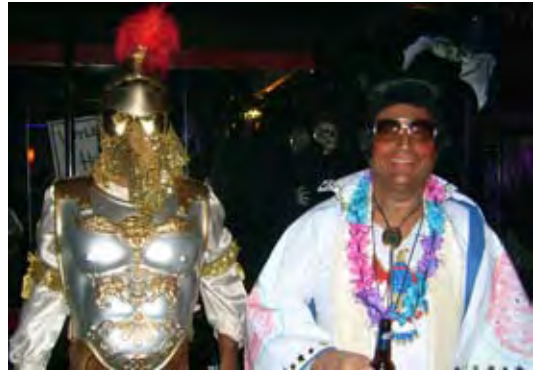
Viva Las Vegas at the Zone.