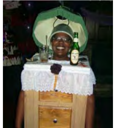
Lighting up at the Zone

Photos from local Halloween events. Lots more! online. For photos from the Latonia and the Zone visit www:eriegaynews.com For photos from Craze visit www.crazeerie.com