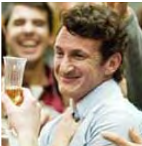
Sean Penn as Harvey Milk

Audiences might want to be aware of the fact that there is a boycott against viewing this movie at Cinemark Theatres, because the company's CEO donated $9,999 to support the anti-gay Proposition 8. Not