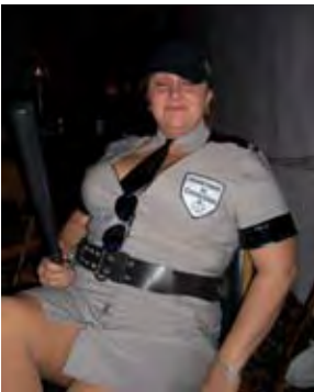
Keeping you in line at Latonia