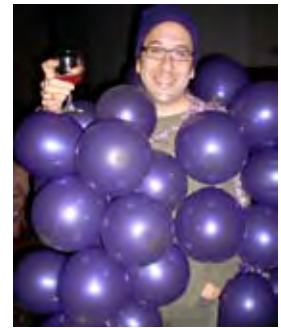
Having a grape time at the Latonia