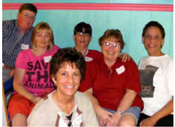
First Womynspace get-together at the Zodiac, April 26.

Support System – By networking, with communication through Womynspace we can lend a listening ear to one of us while she is going through a difficult