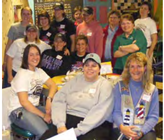
Womynspace get-together at Zodiac Dinor. Read more about Womynspace on page 15

The group from Erie will be attending a networking event and will meet with Plexus leaders at that time. They will report back to the Erie Gay Business