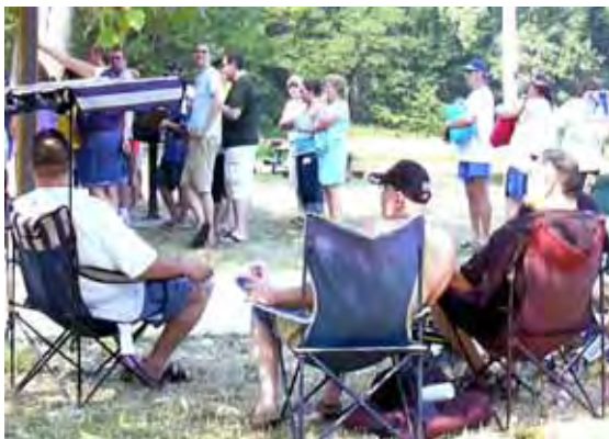
Erie Pride Picnic takes place June 2 at Presque Isle.

Sept 7-9 - Sisterspace weekend (Maryland) www.sisterspace.org