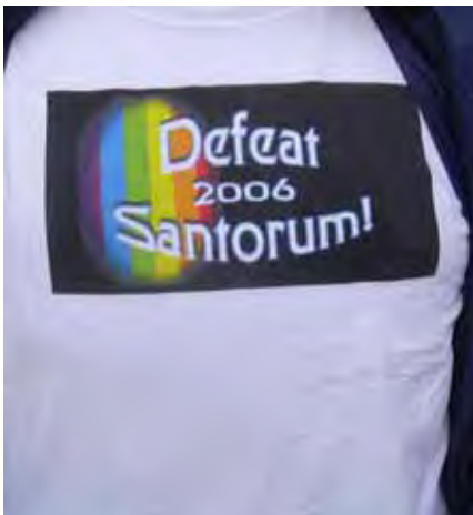
Defeating the anti-gay Senator Rick Santorum was the highest priority for many GLBT activists around the state. This T-shirt was worn by an attendee at the Erie Pride Rally.