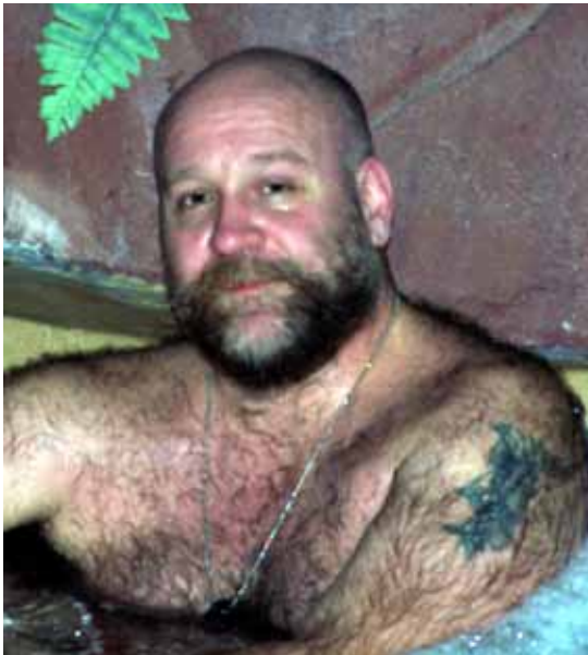
Relaxing at the 2nd Drenched Fur event (see "Community News" for wrap-up of the weekend).