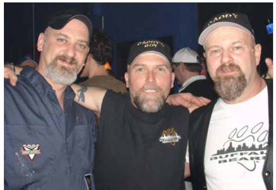
Some of the guys from the first Drenched Fur Weekend Bear event. Drenched Fur II will be held March 24-26, 2006.