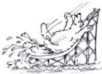
DRENCHED FUR II

Folks interesting in learning more about the plans for this year's activities, and helping volunteer, can join us for a run through of the work done to date. Several exciting things are lined up and we can use your assistance. Transportation is being added this year's weekend for all event attendees that purchase a run package. In addition, all Splash Lagoon participants will also receive their very own Drenched Fur '06 beach towel. Entertainment and a dinner are also planned for the Saturday night line up. Anyone with a background in event/convention planning, volunteer coordinating, catering, transportation, promotions, sponsorship, media recording and Internet design will