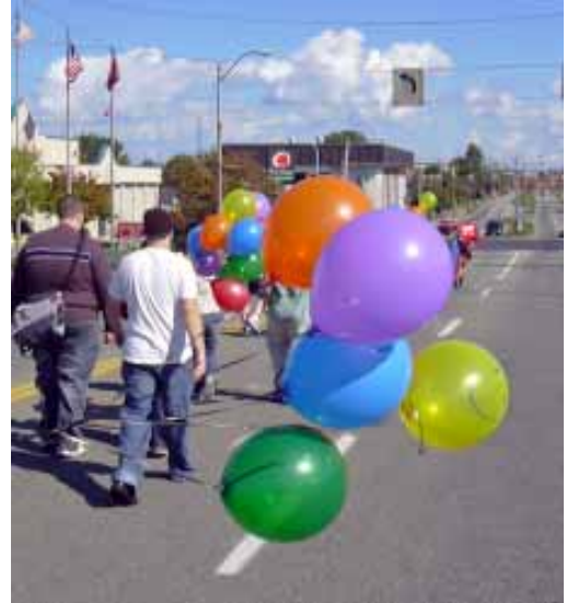
Erie Pride March October 15, 2005