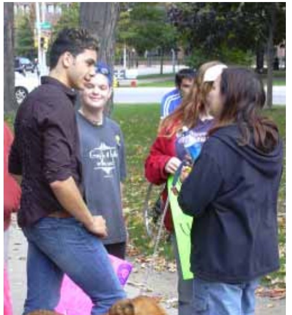
Meeting friends at the Rally in Perry Square