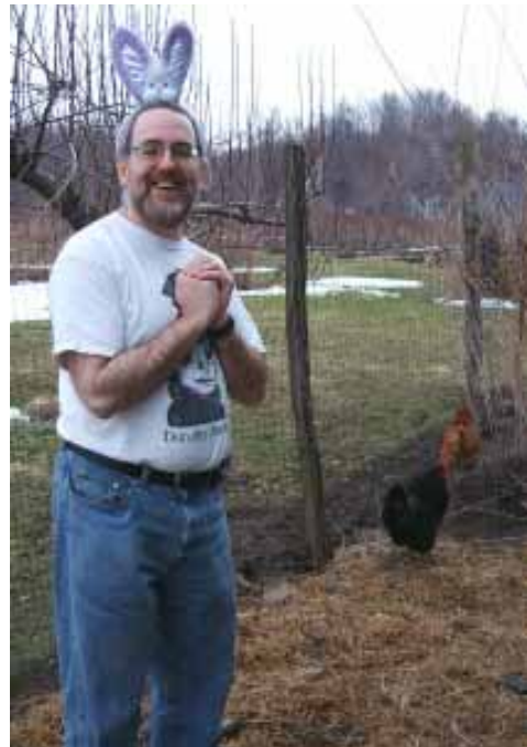
Plotting to steal some eggs from Mr. Rooster, before discovering a problem with the plan.