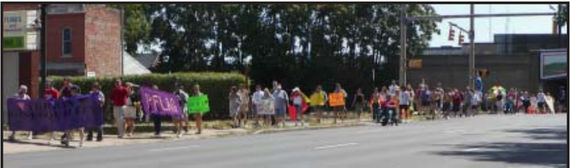
Marchers at last year's Pride weekend. See details on this years' events on page 7