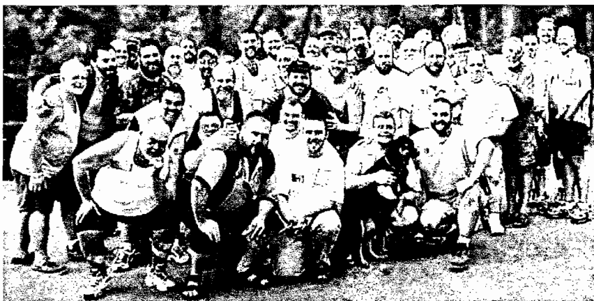
The gang at the WOOF Weekend Picnic in the Burgh during Labor Day Weekend.