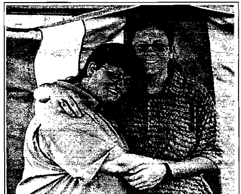
The colors of love (use your imagination)

Wisdom 4 Women -- A site dedicated to the lesbian heart. www.wisdom4women.com .